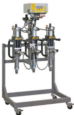
TwinControl 5-60 for airspray applications

The TwinControl can be configured for your individual application purpose.