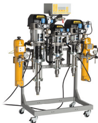
TwinControl 35-70 with material heaters for AirCoat applications