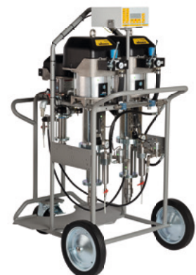
TwinControl 72-200 for heavy corrosion protection, mounted on a trolley