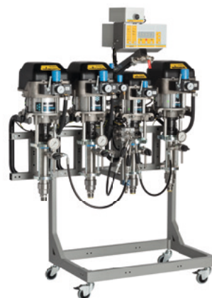
TwinControl 35-70 with extension for a second color